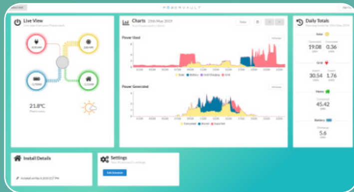
Powervault user interface

Powervault's energy storage system helps homeowners to reduce their energy consumption by storing low cost renewable electricity in their homes. Carbon emission reduction is moving us to an era where most electricity will be generated by wind and solar energy. This energy is often generated when it is not needed, so it must either be stored or wasted. Clean electricity will also be used to power electric vehicles and heat our homes. These factors create the opportunity for home energy storage. Our vision is to become as common place as a washing machine or dishwasher.